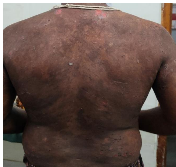
Figure 2: Condition of the skin after treatment with 2 nd dose of Inj. Rituximab