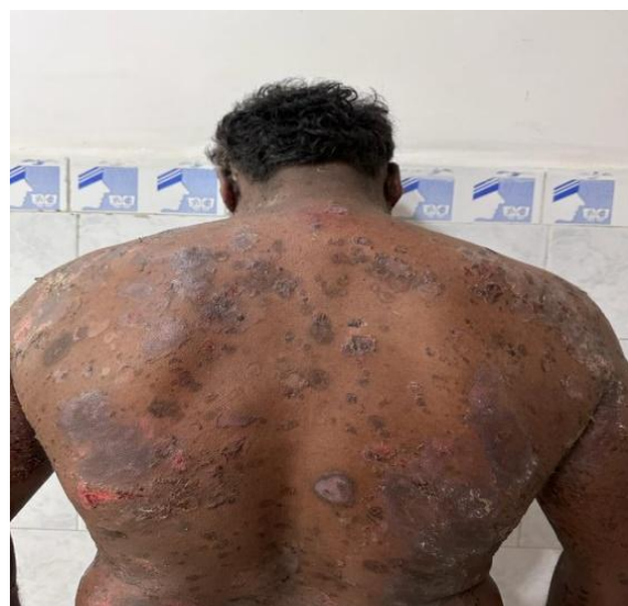
Figure 1: Condition of the skin after treatment with 1 st dose of Inj. Rituximab

After 5 days of admission, a complete improvement was seen and the patient was discharged with Tab. Prednisolone 40mg/po/od, Tab. Mycophenolate Mofetil 360mg/po/bd, Tab. Levofloxacin 500mg/po/od, Tab. Hydroxyzine 25 mg/bd and suggested the appointments with his healthcare professional for follow up.