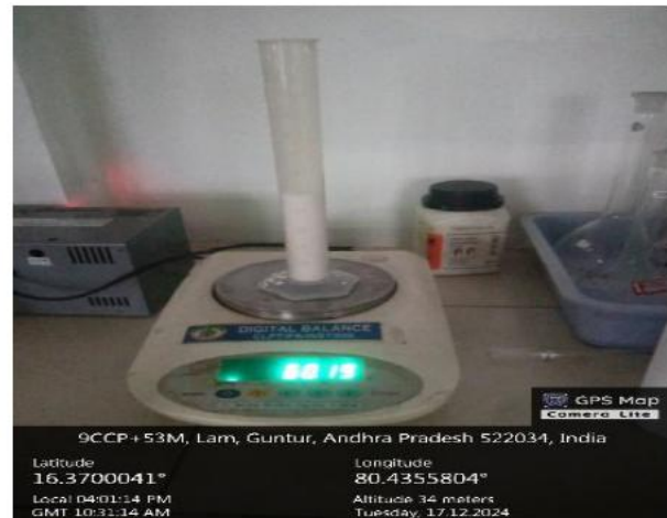
Fig.4. Weight of the Cylinder + Powder