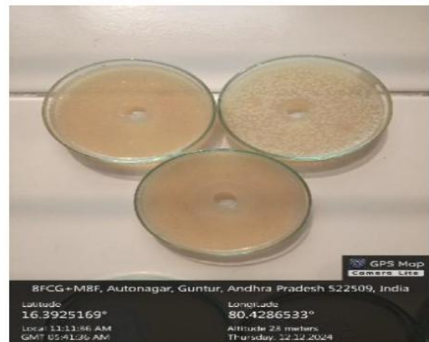
Fig 6. Zone of Inhibition of Bacteria against Powder Suspension