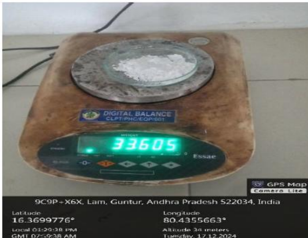
Fig.1. Weight of the Powder before Drying