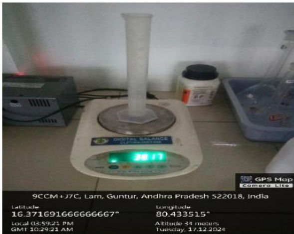
Fig.3. Weight of the Empty Cylinder